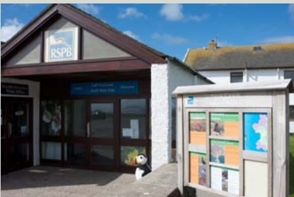
Caffi South Stack

Erbyn hyn mae Caffi South Stack yn eiddo'r RSPB ac, fel arbrawf, maen nhw'n cadw'r caffi ar agor tan 4 Ionawr gan obeithio y bydd cerddwyr a dringwyr yn taro i mewn m baned.