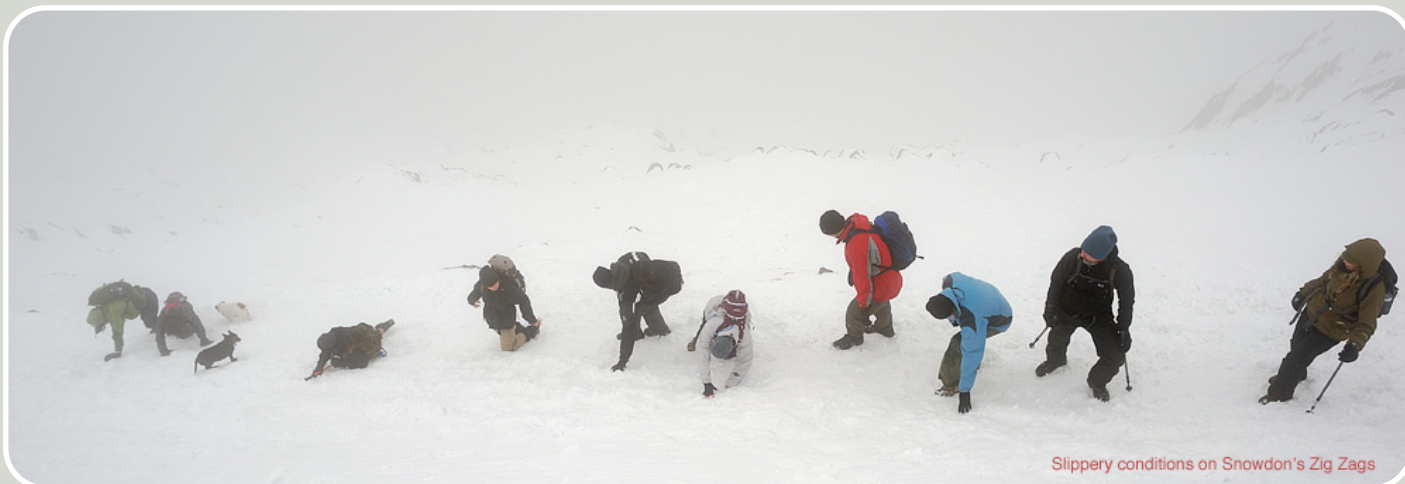
Slippery conditions on Snowdon's Zig Zags